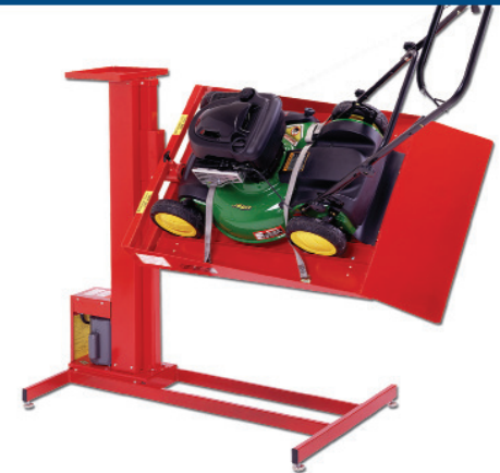
Adjustable wheel channel