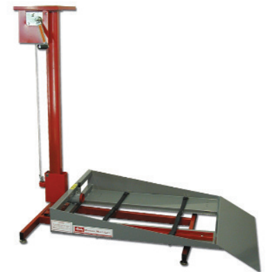
Lowers to 5" for easy loading